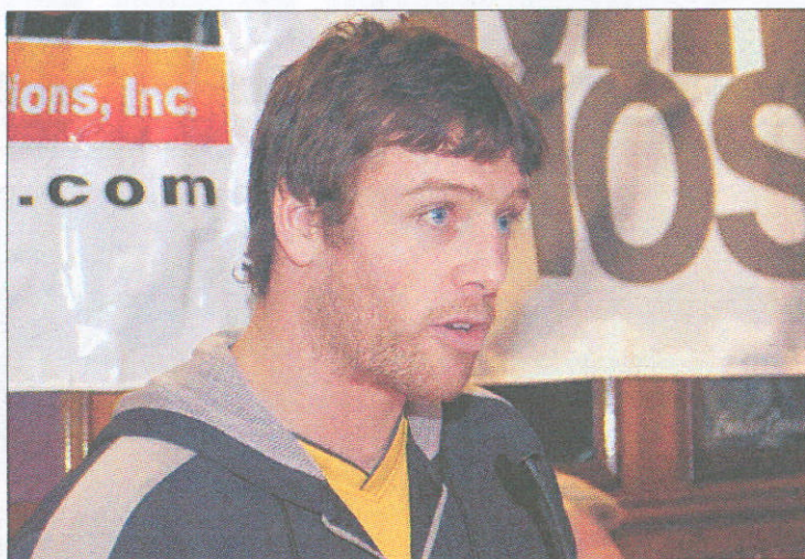
John Duddy, seen here late last year, says he is ready for his June 10 bout at Madison Square Garden.

Bernard Dunne's intriguing clash with once beaten American